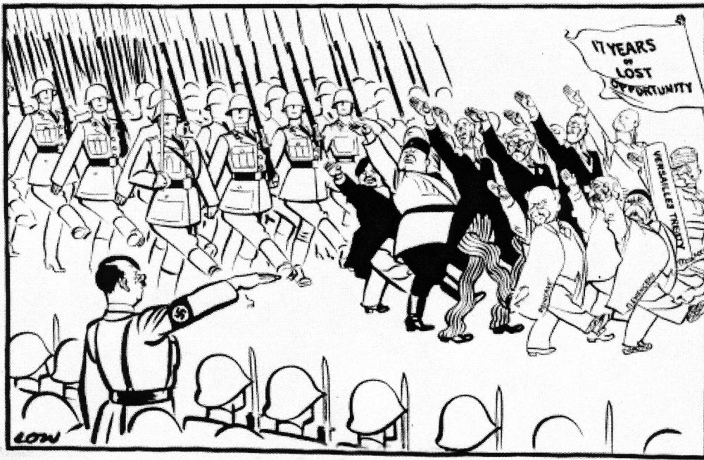
A cartoon, entitled 'Cause Precedes Effect', published in a British newspaper, 1935. It shows a parade of world statesmen led by the Versailles peacemakers.