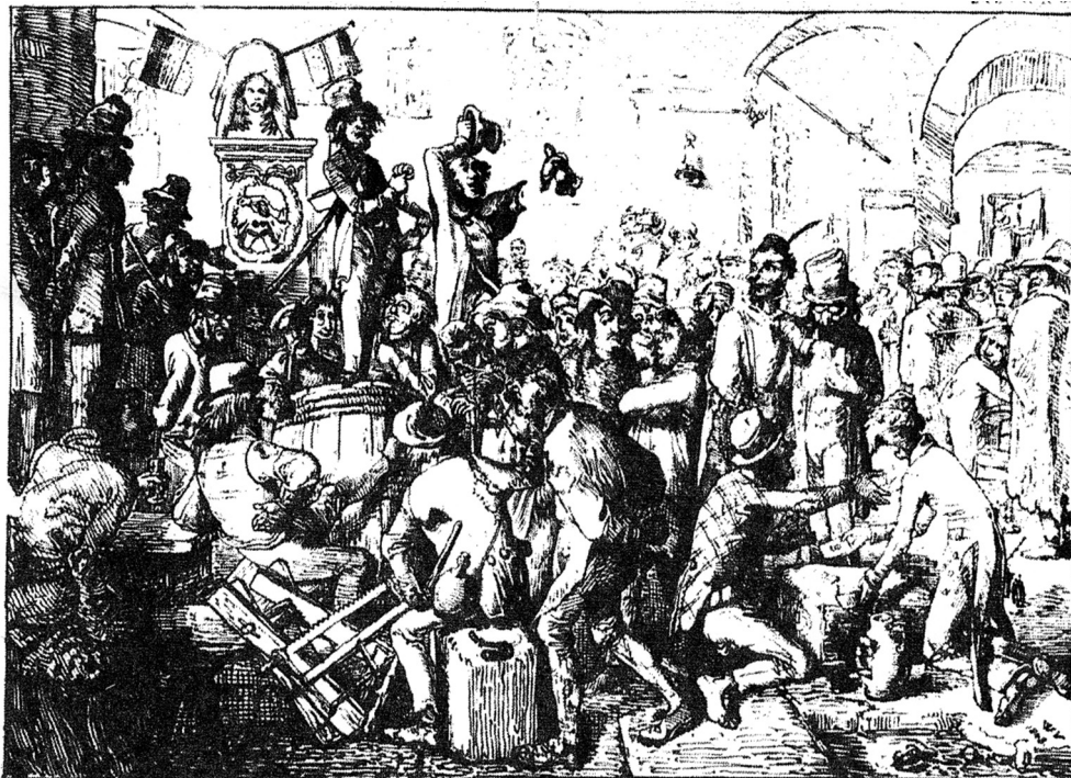
A cartoon published in Germany in 1848 entitled 'Parliament of the future'.